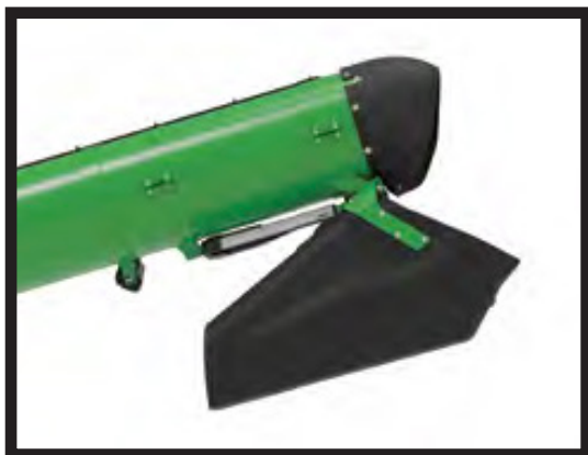
Road Transport Position

Prevents grain dribbling in the field and in transport