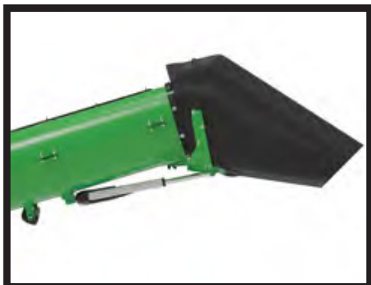
Field Transport Position

Easier to unload into grain cart or trailer